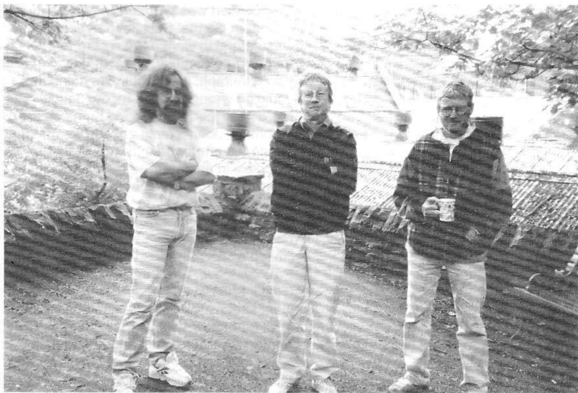
Time for a tea-break and some fresh air...